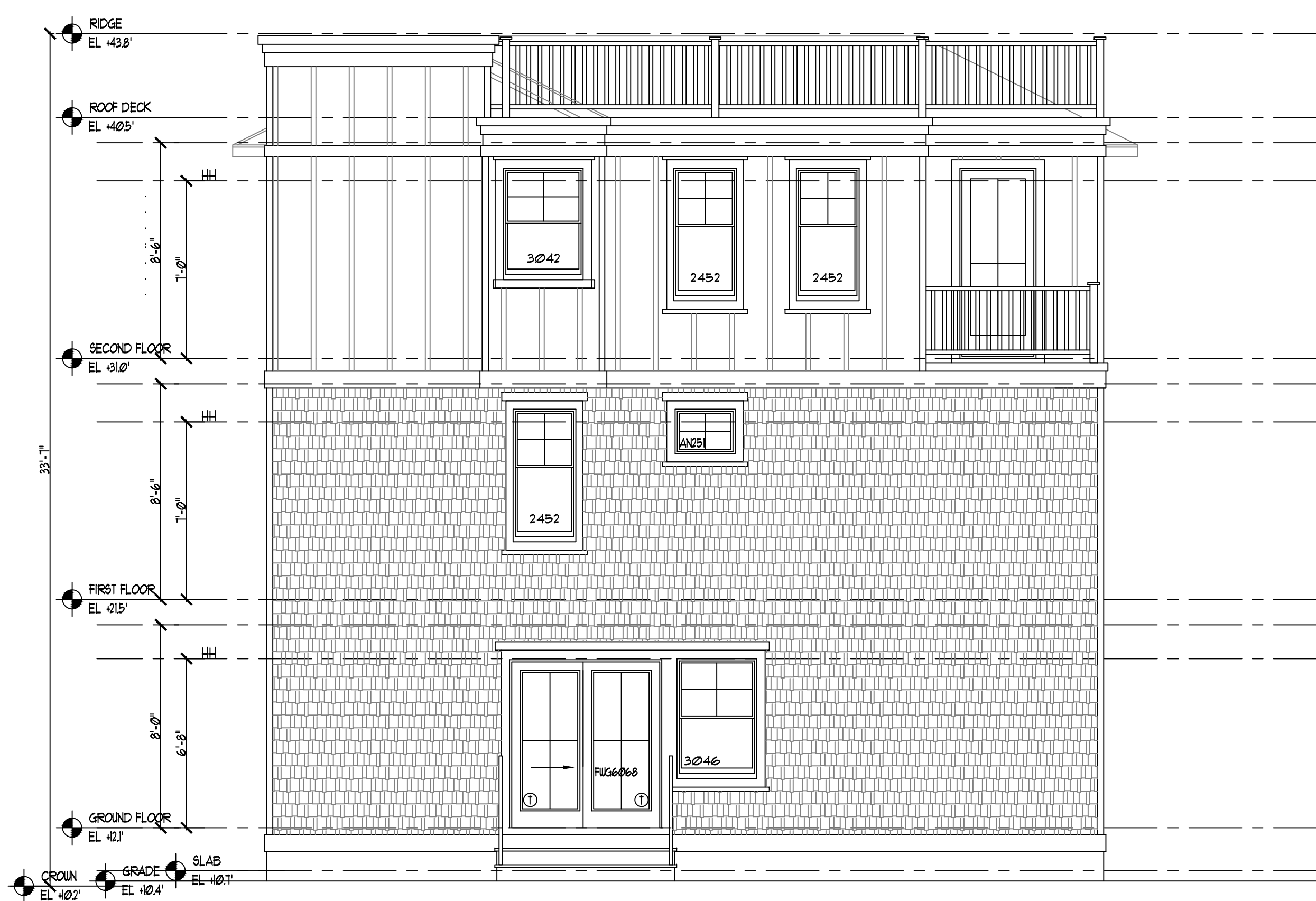
4 REAR ELEVATION SCALE: 1/4"=1'-0"

PERSKIN RESIDENCE 111 EAST OCEANVIEW DR LOT 4 BLOCK 12.18 LONG BEACH TWP, NJ ELEVATIONS