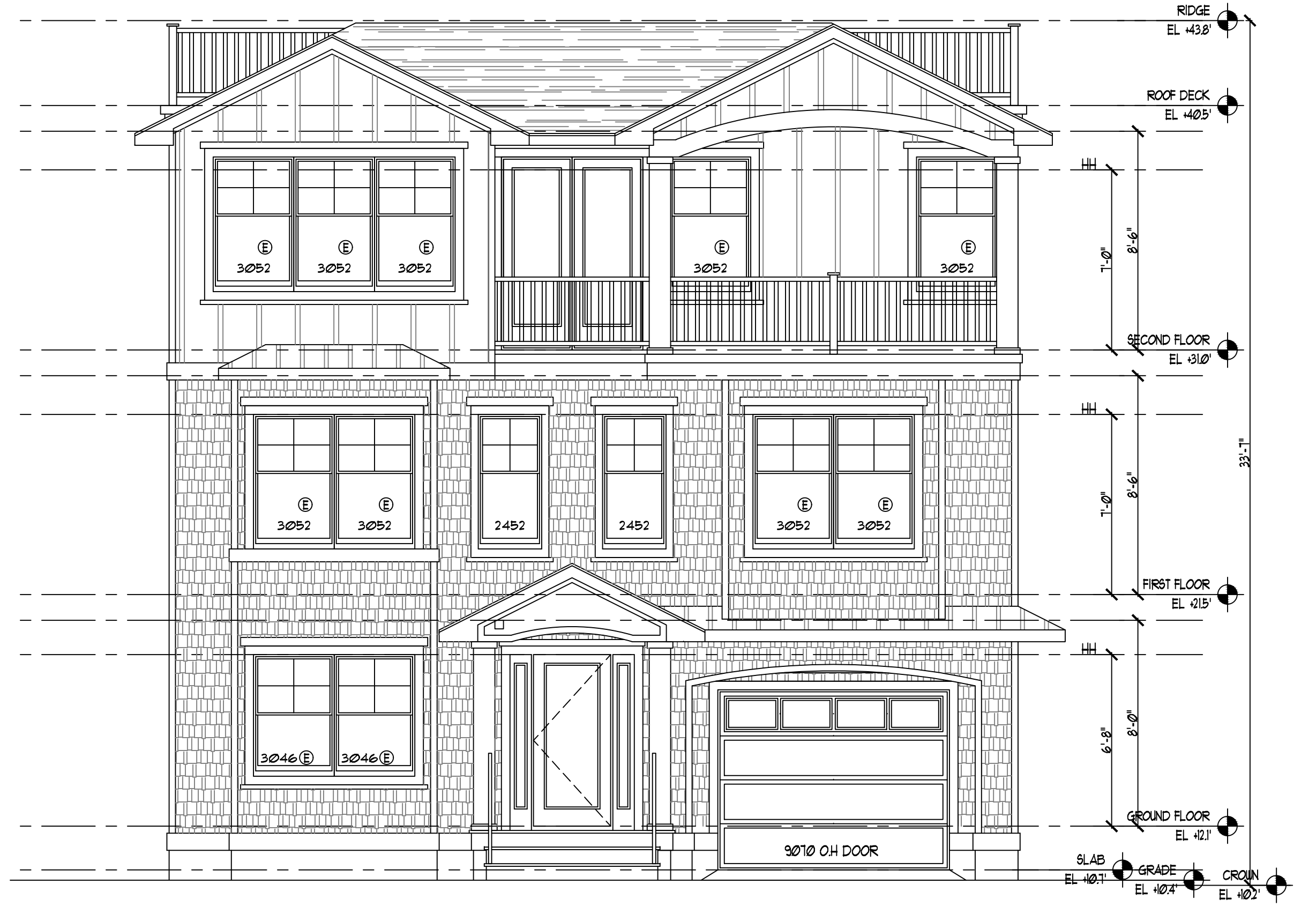
1 FRONT ELEVATION SCALE: 1/4"=1'-0"