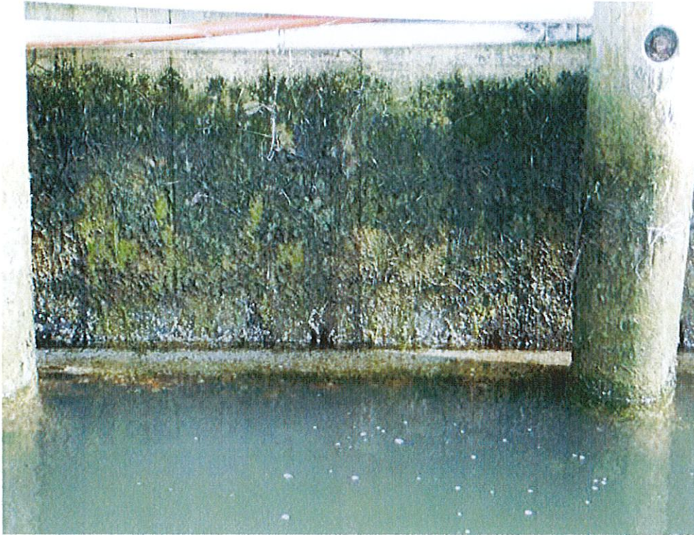
Photo 17: Deteriorated bulkhead with hole in sheet pile at north side near the northwest corner