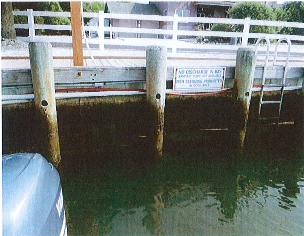
Photo 16: Typical safety ladder and view of the portion of bulkhead in the tidal zone