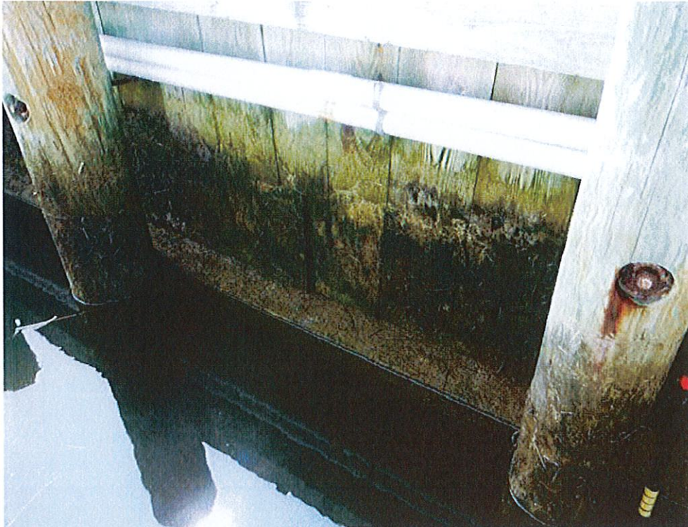
Photo 24: Plywood patches on bulkhead near the south end of G Dock