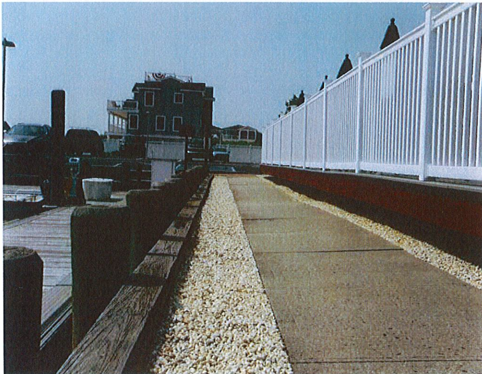
Photo 18: Looking south along the bulkhead and pool deck with subsided walkway