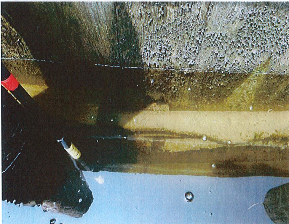
Photo 27: Wale with 70% section loss and hole in sheet pile near slip F Dock Slip 6