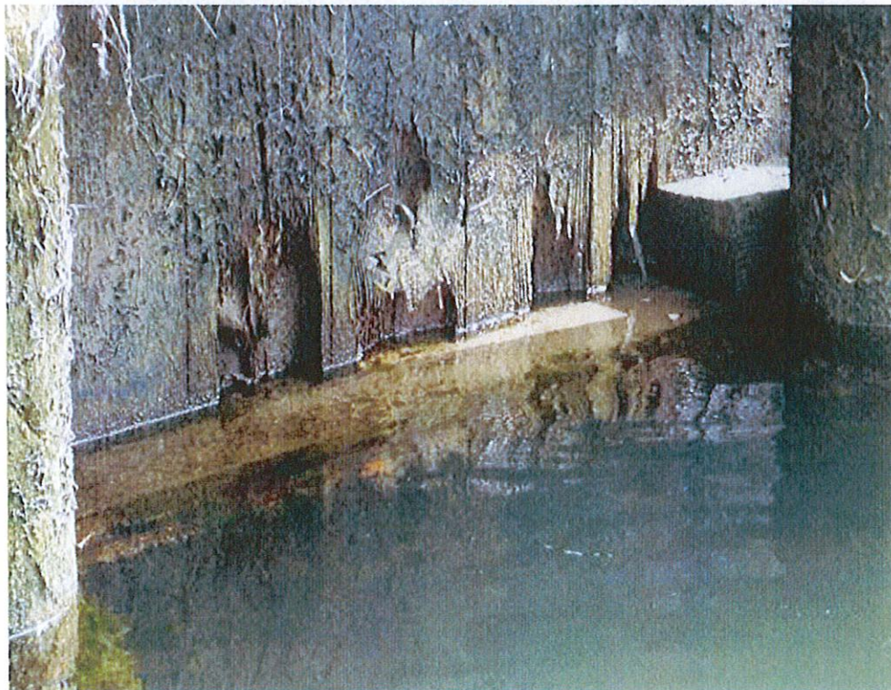
Photo 14: Close up of Photo 13 showing incipient holes in sheet pile and holes/heart rot in middle wale