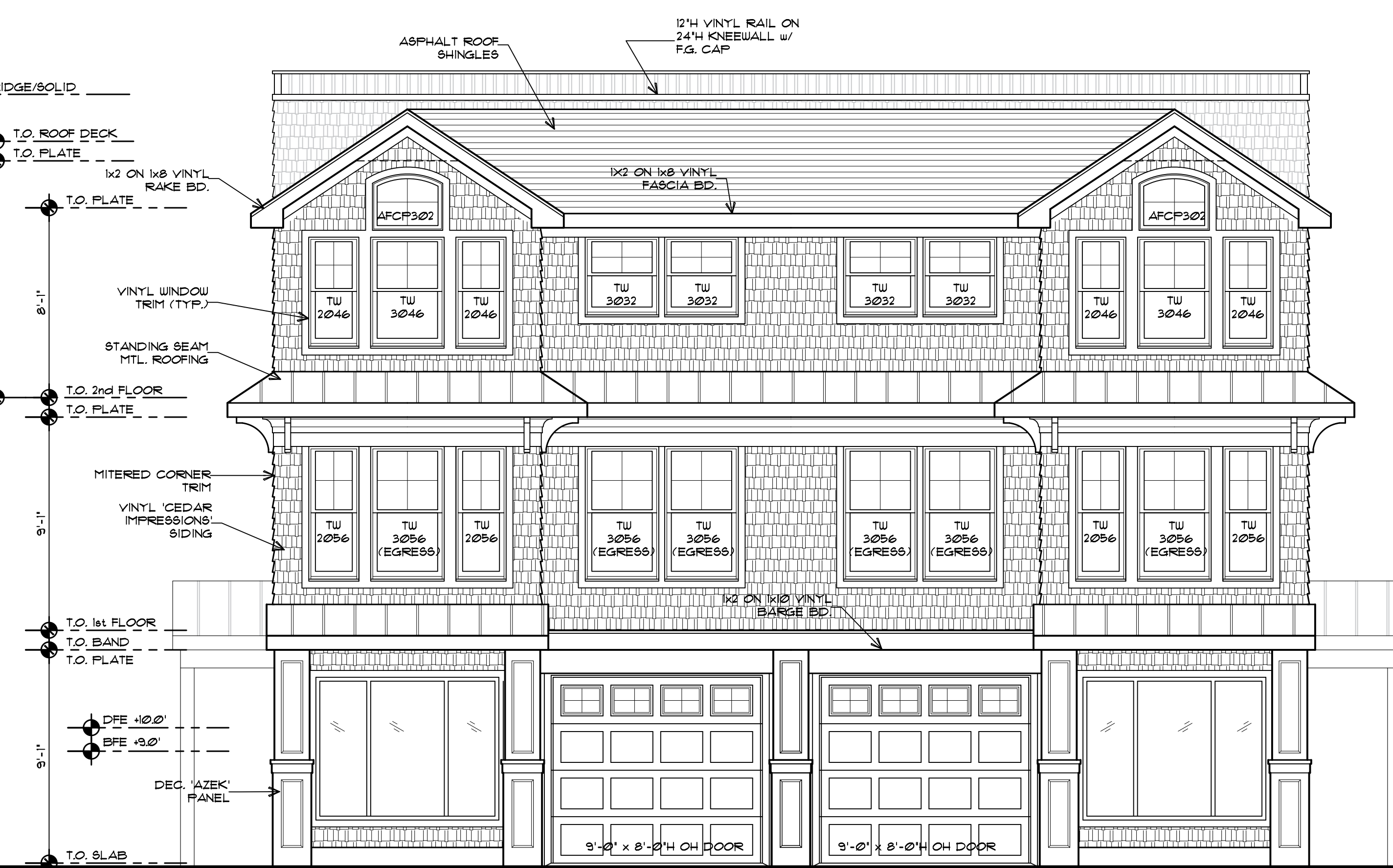
FRONT (EAST SIDE) ELEVATION 1/4" = 1'-0"

799 Route 72, Manahawkin New Jersey 08050 www.cwbearley.com (Phone) 609-597-8880 (Fax) 609-597-5289