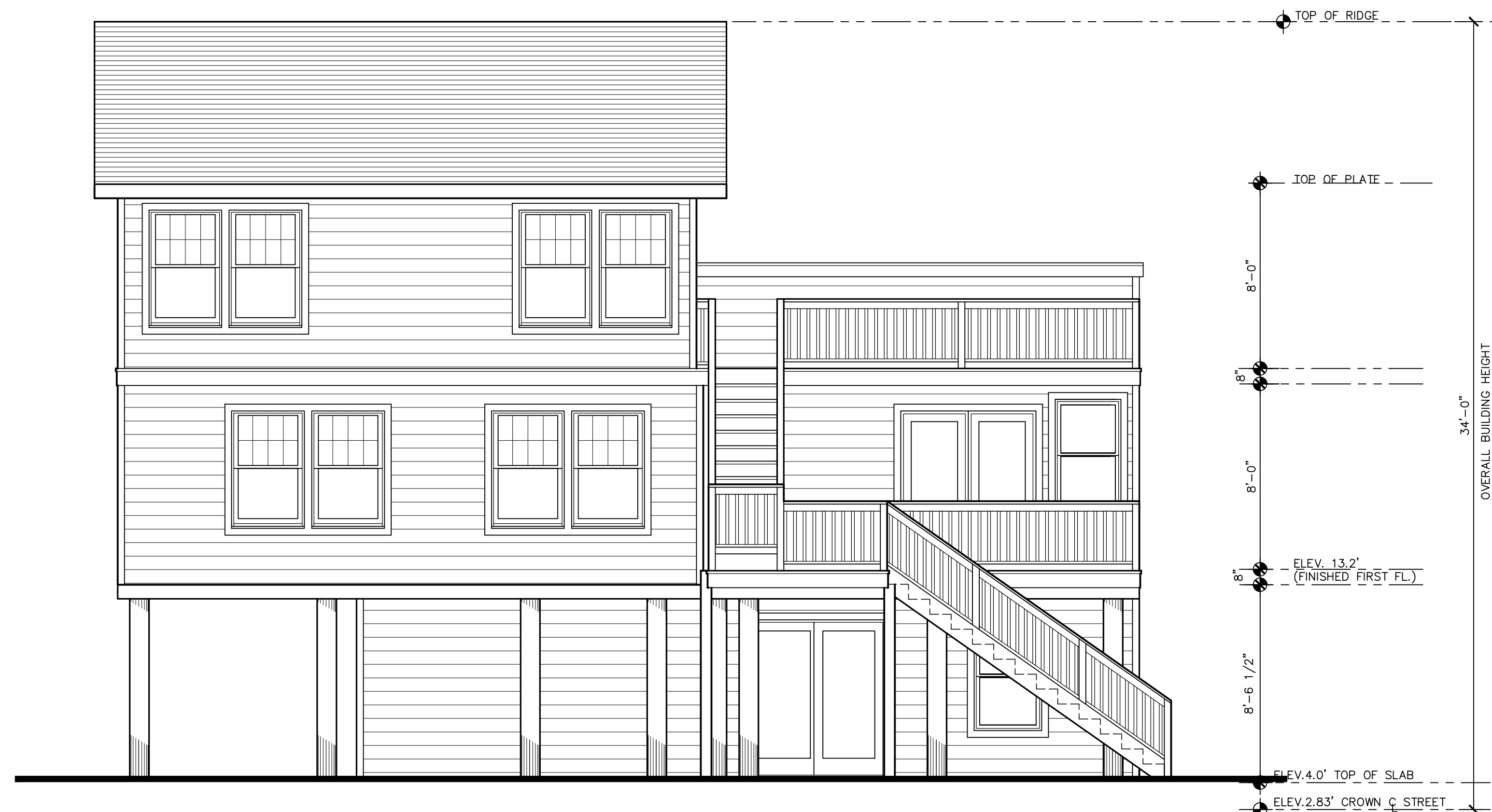
LEFT SIDE/WEST ELEVATION SCALE: 1/4"=1'-0"