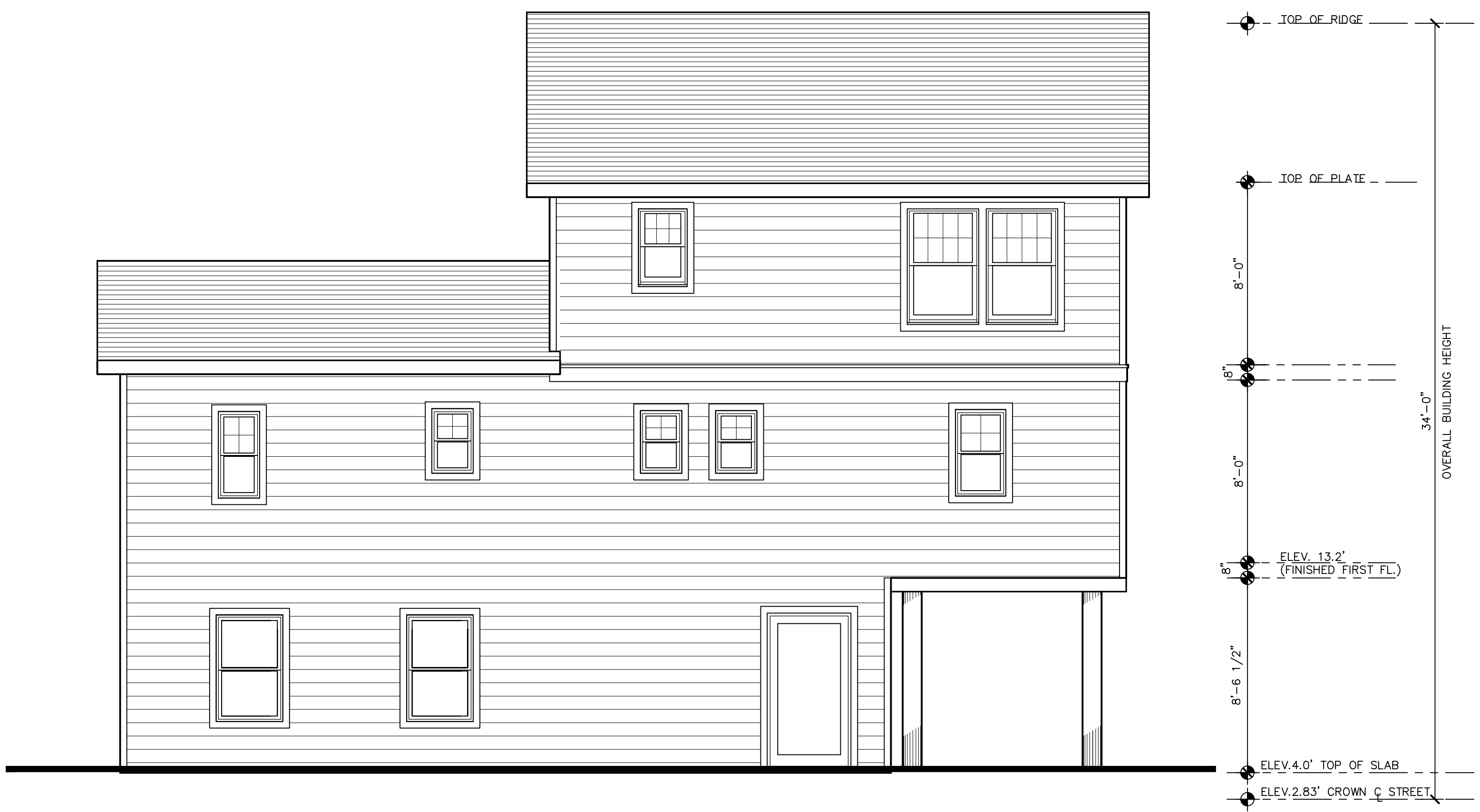
RIGHT SIDE/EAST ELEVATION SCALE: 1/4"=1'-0"