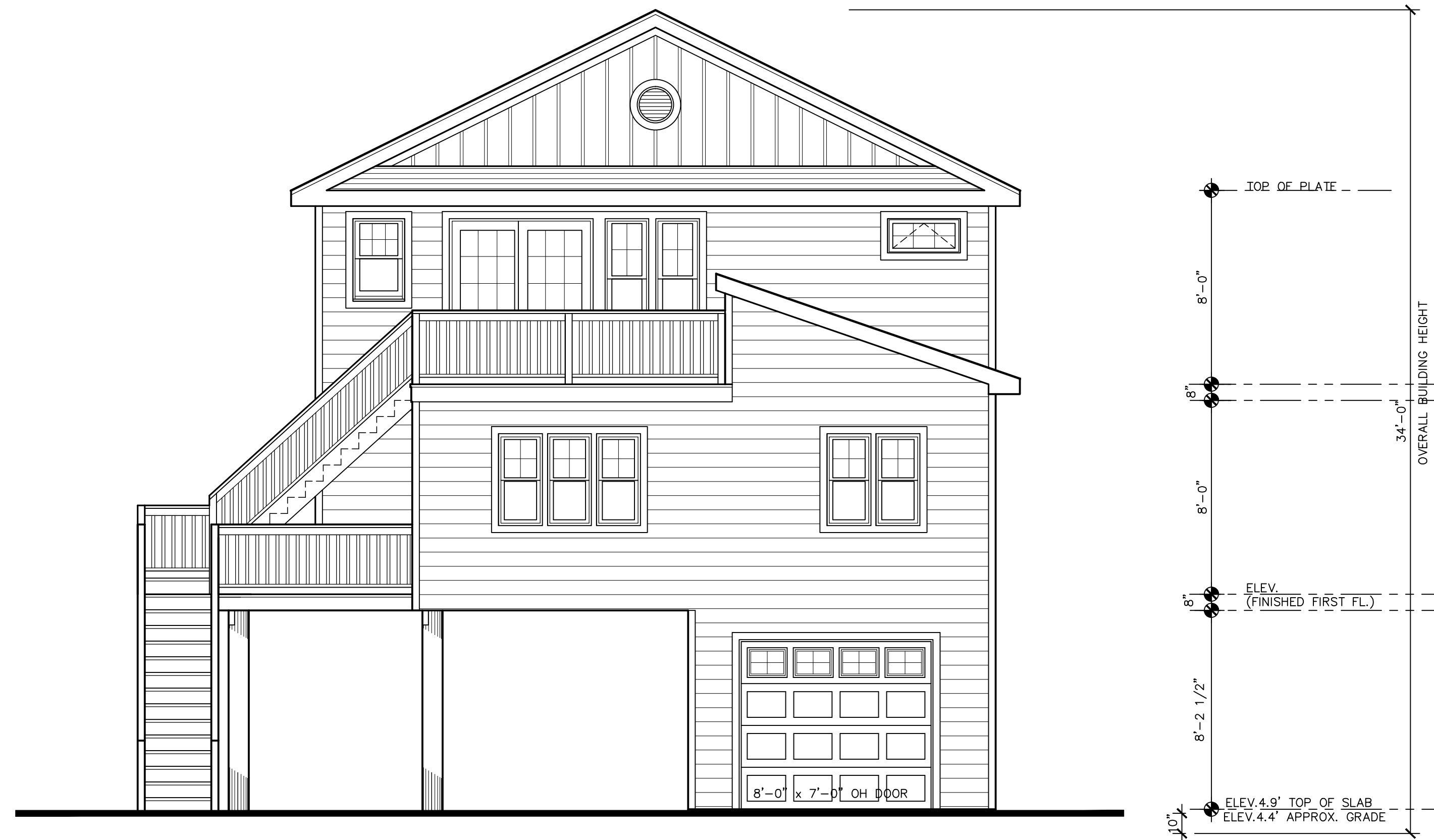
FRONT ELEVATION SCALE: 1/4"=1'-0"