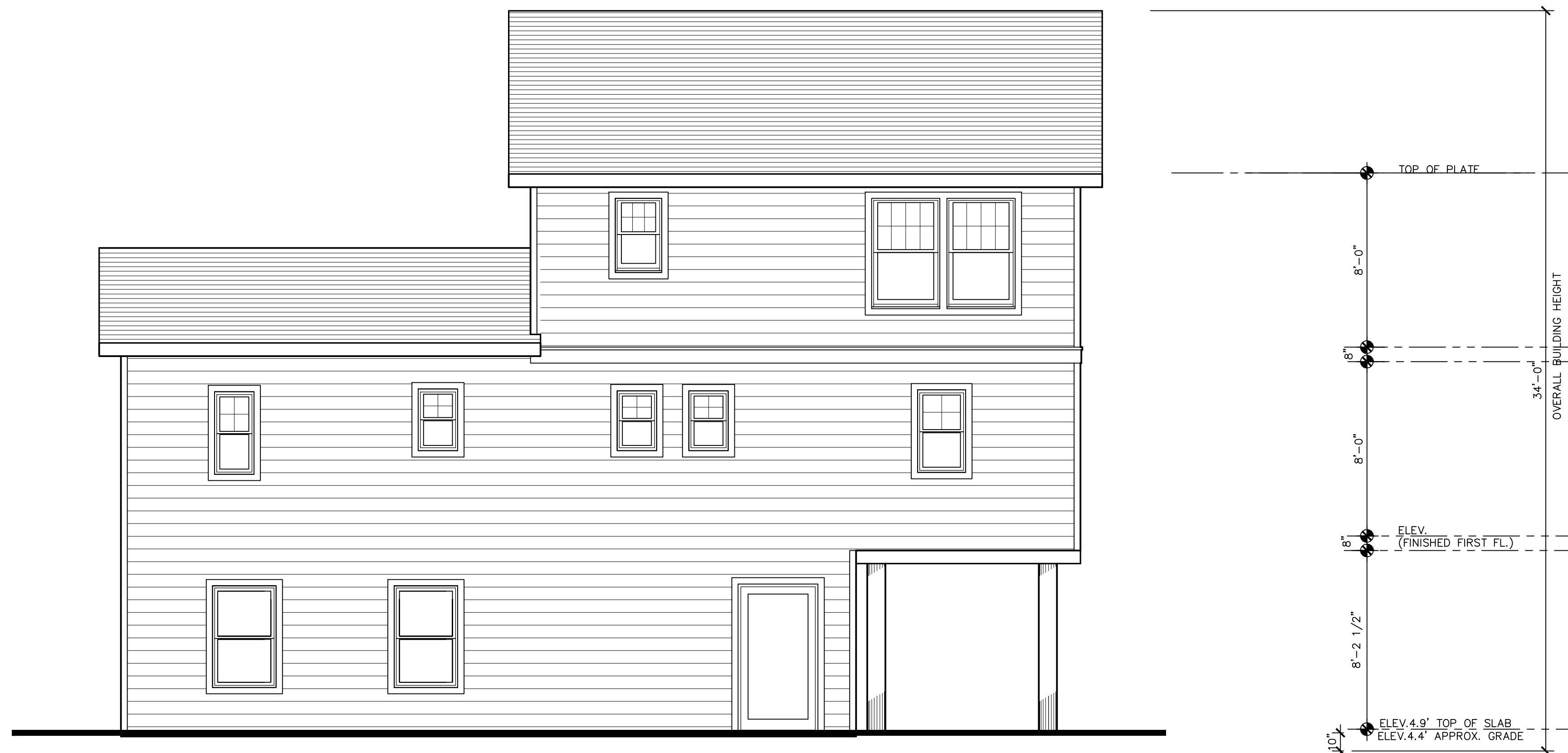
RIGHT SIDE ELEVATION SCALE: 1/4"=1'-0"