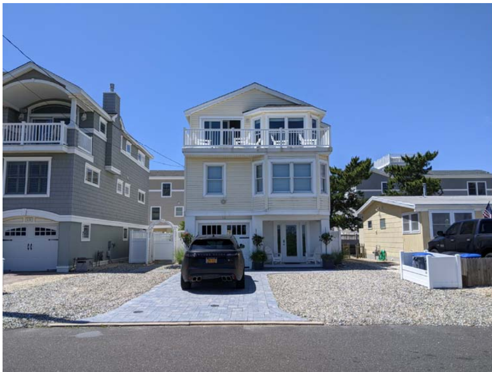
12 West Rosemma Avenue, Lot 47, Block 1.55