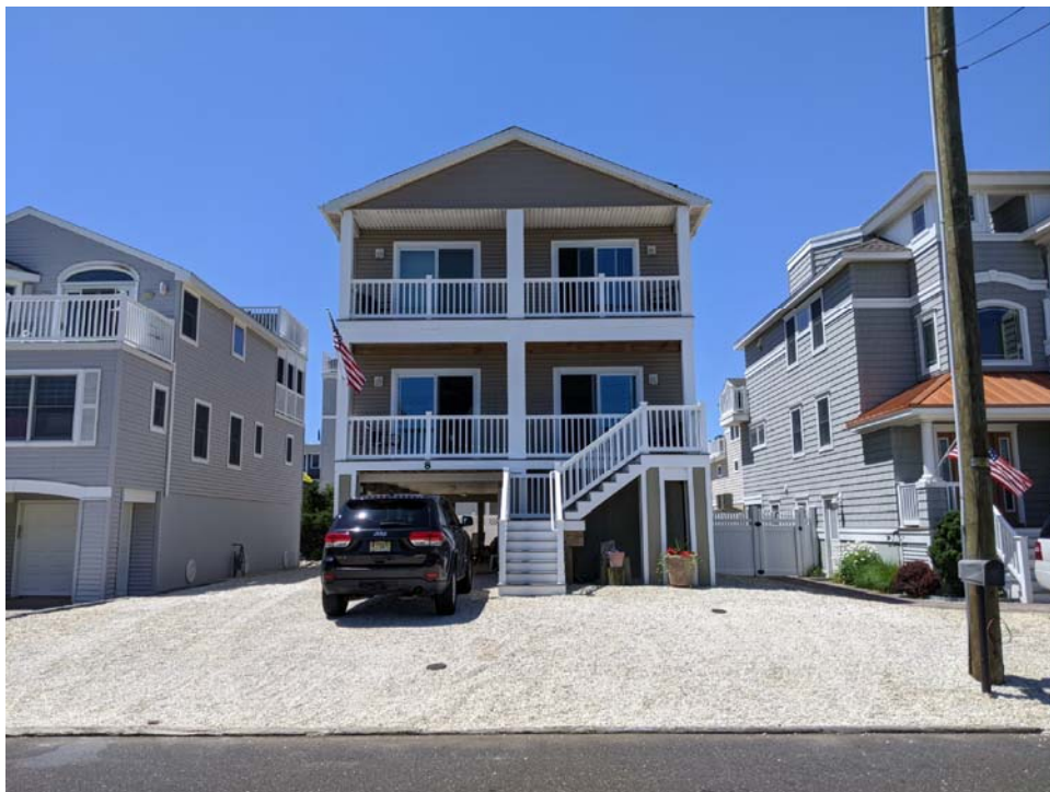
8 West Rosemma Avenue, Lot 45, Block 1.55