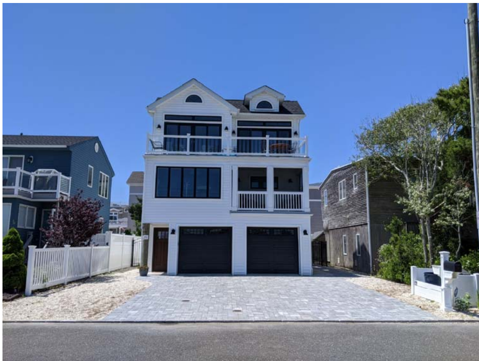
20 West Rosemma Avenue, Lot 80, Block 1.55