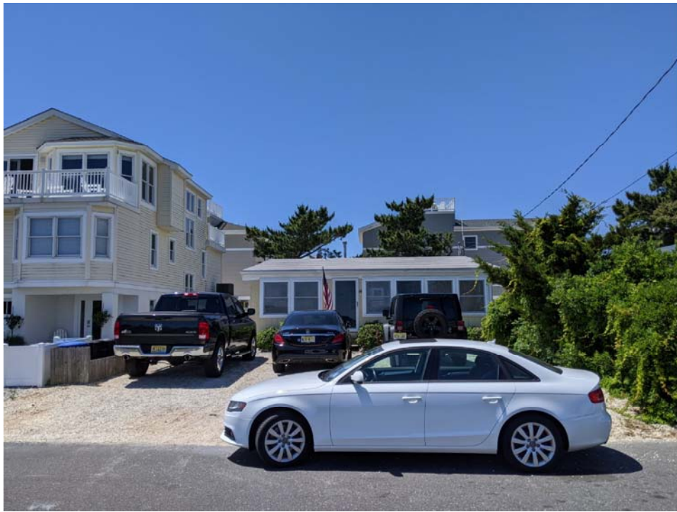
14 West Rosemma Avenue, Lot 48, Block 1.55