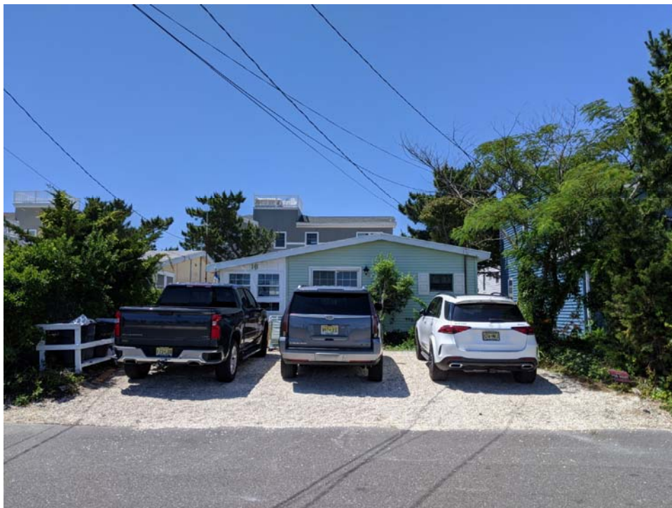
16 West Rosemma Avenue, Lot 49, Block 1.55