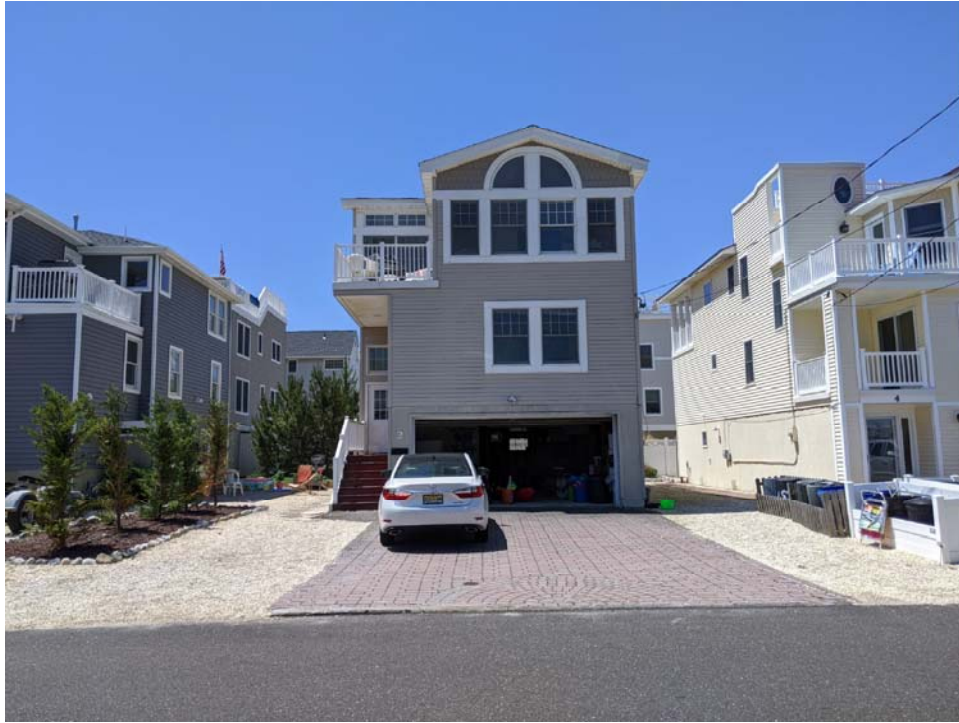
2 West Rosemma Avenue, Lot 42, Block 1.55