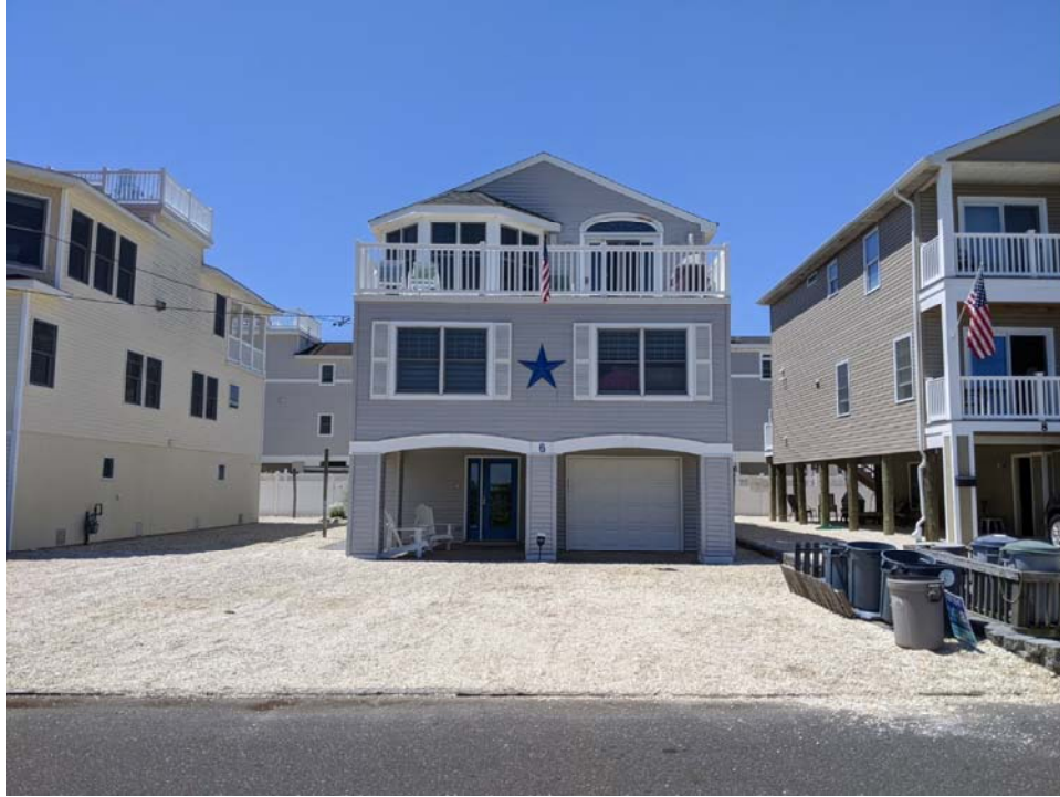
6 West Rosemma Avenue, Lot 44, Block 1.55