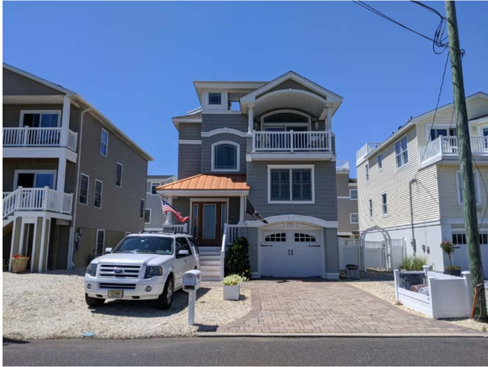
10 West Rosemma Avenue, Lot 46, Block 1.55