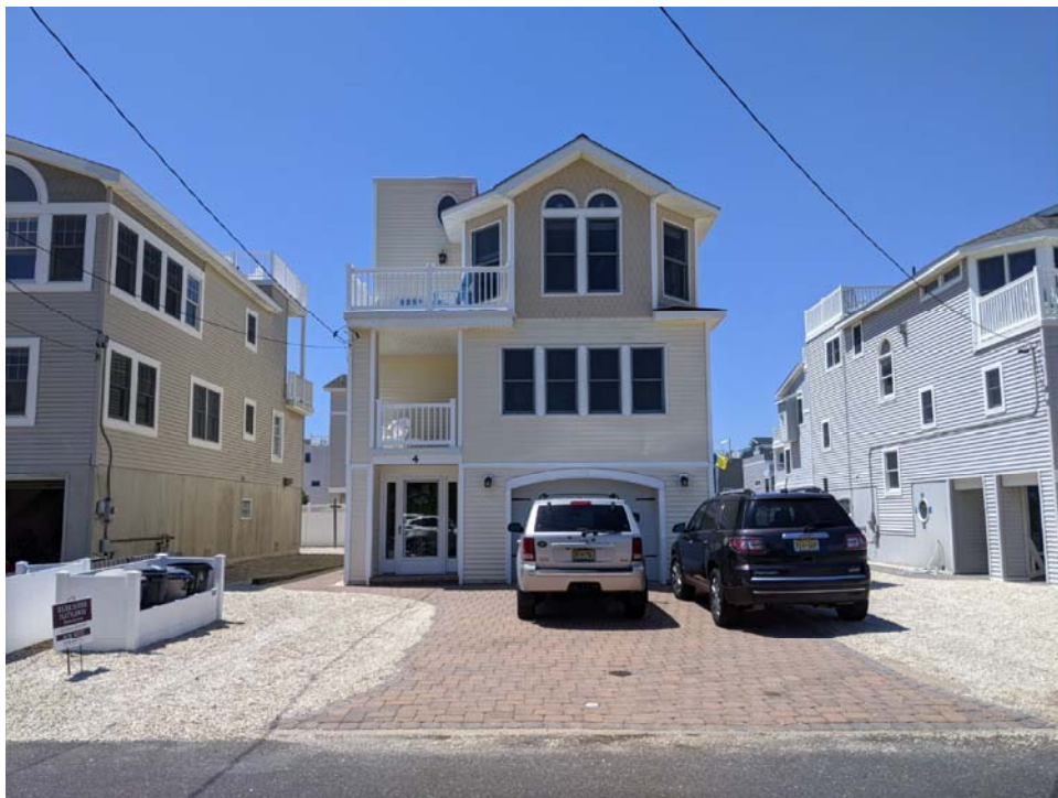
4 West Rosemma Avenue, Lot 43, Block 1.55