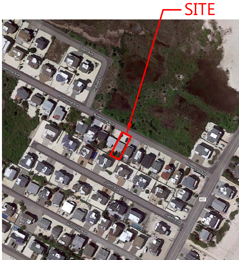
Aerial Photograph (Google 2020)