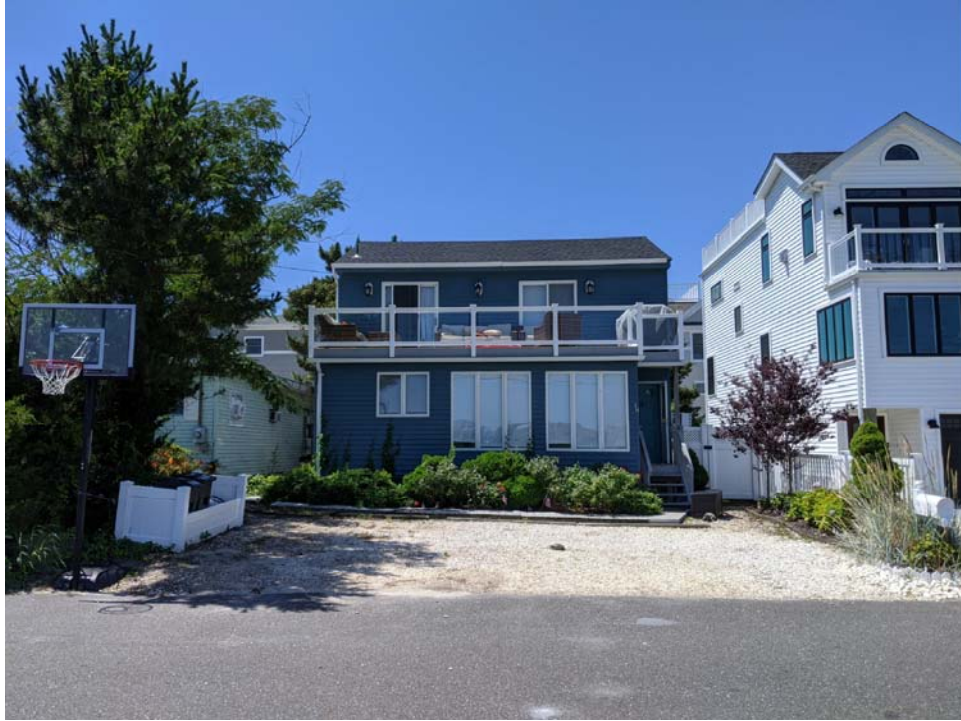
18 West Rosemma Avenue, Lot 50, Block 1.55